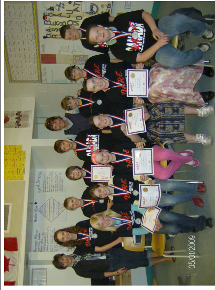
Grade 6 D.A.R.E. Graduation